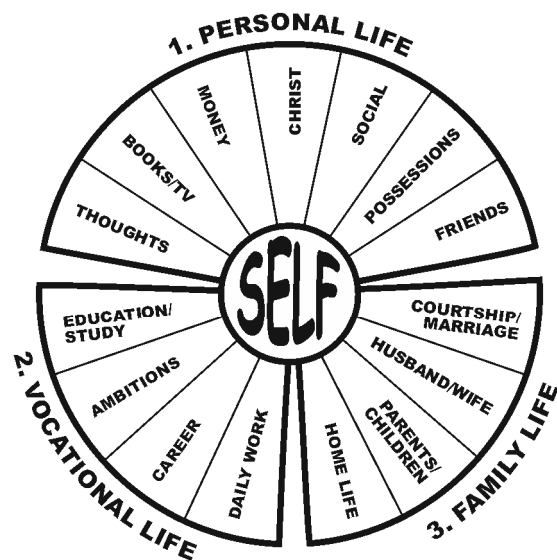
The Self-Controlled Life with Jesus as a Lodger

John 15:14 [NIV] "You are my friends if you do what I command."